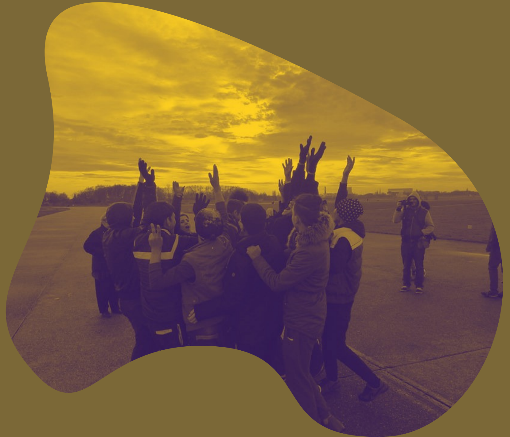
Unite, Berlin, 2014