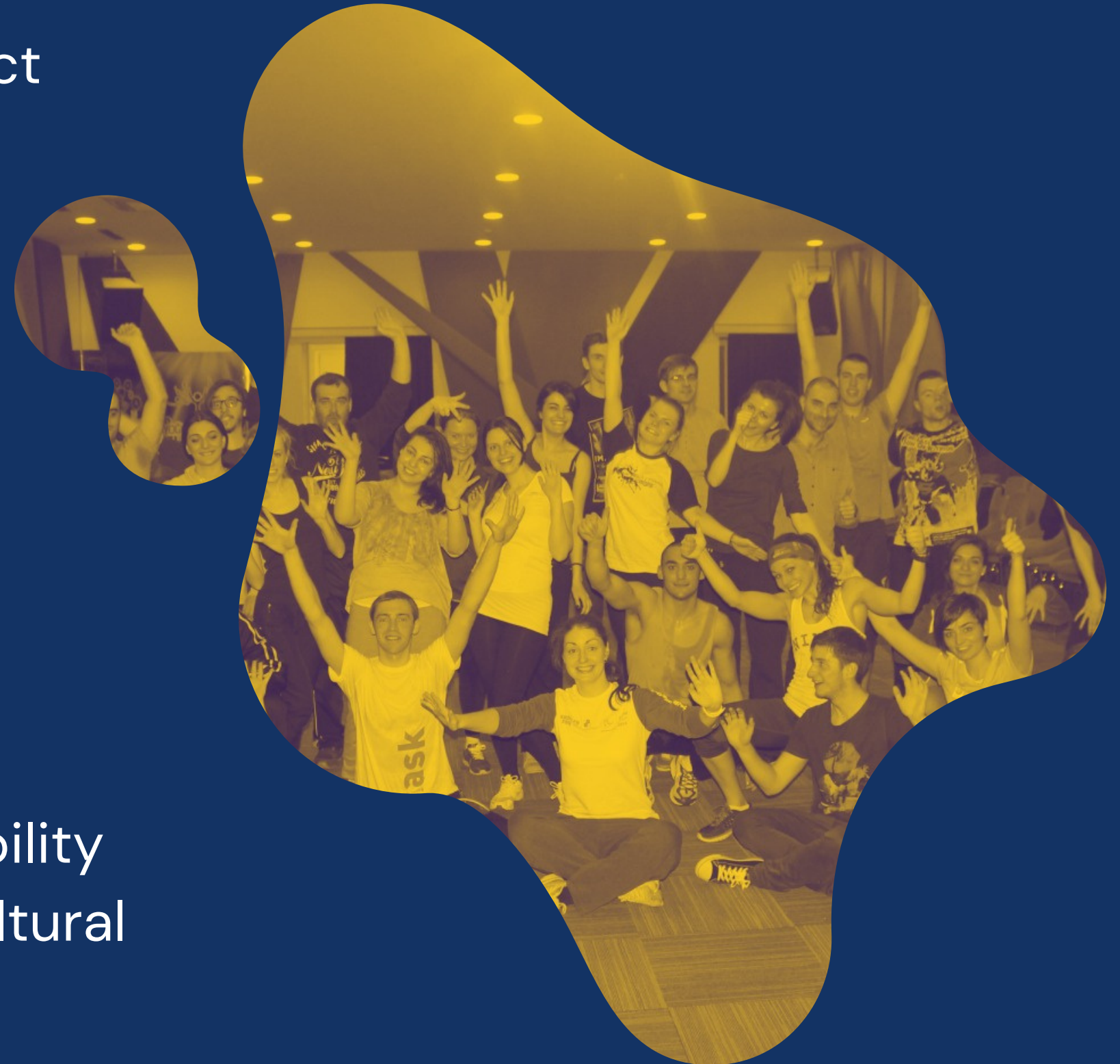
WorkItOut, Istanbul, 2011