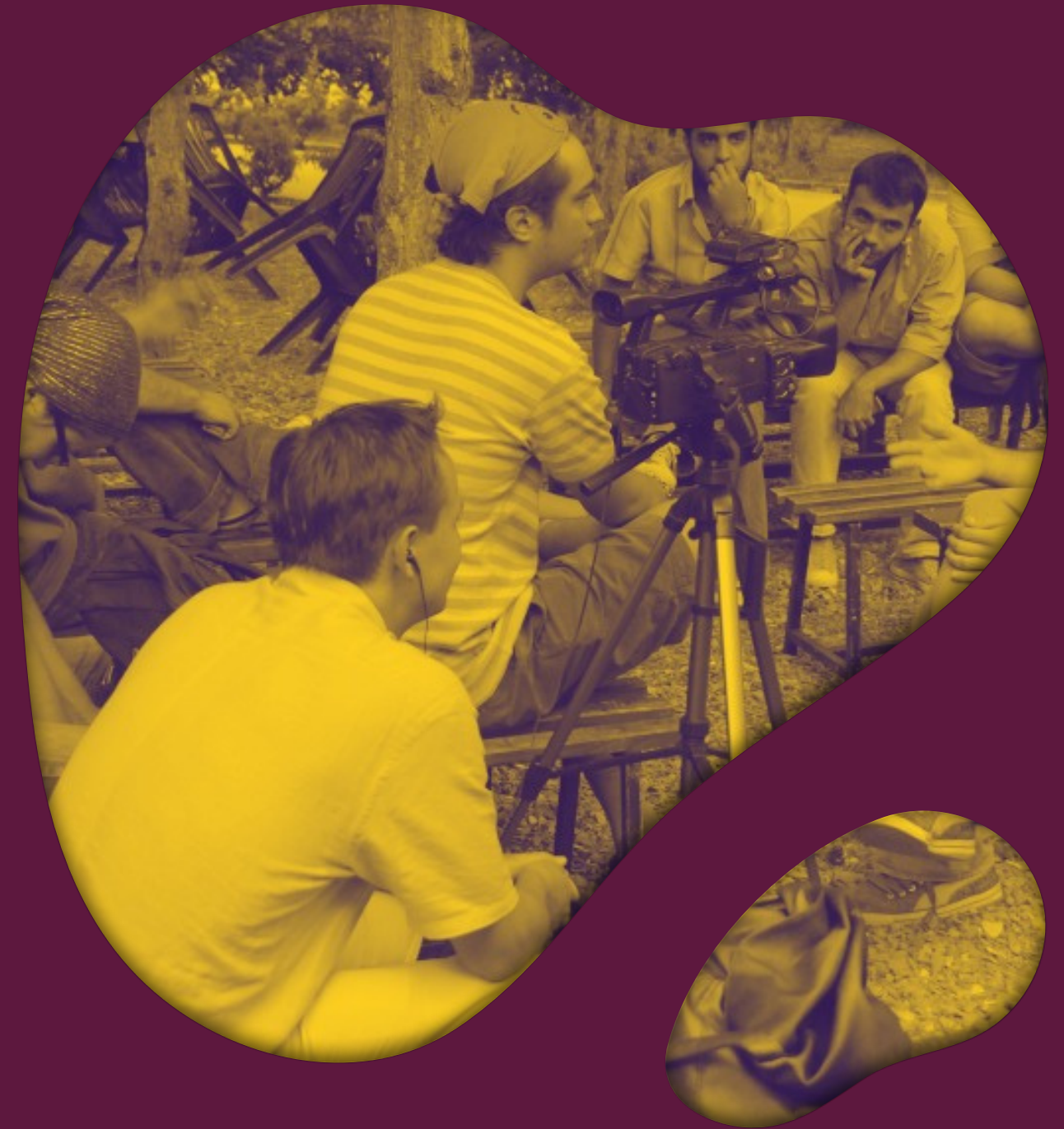
Youth and Unemployment, Ankara, 2009

Please CLICK HERE to learn more about us and our previous projects.